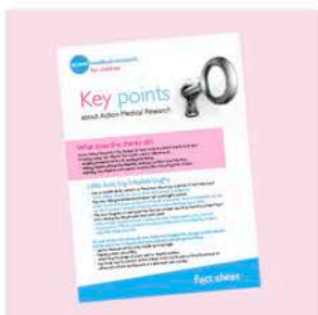
Key points about Action fact sheet