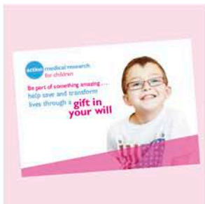
Gifts in Wills leaflet