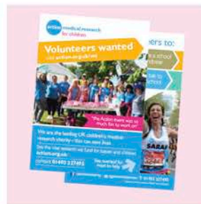
Volunteers wanted leaflet