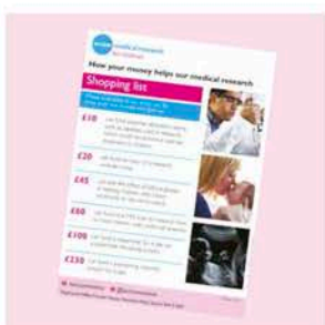
Flyer with 'shopping list'