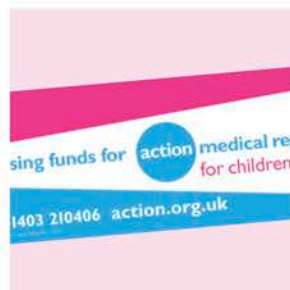
Large vinyl banner*